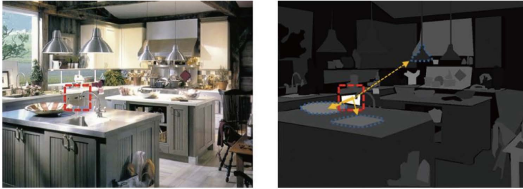
FIGURE 6 | An illustration of a semantic saliency map in an inspection task, as proposed by Hwang et al. (2011). Left: the original scene. Right: The semantic saliency map based on the currently fixated object labeled “dishwasher.” The luminance of each object indicates how semantically similar it is to the dishwasher, as quantified by the corresponding LSA cosine

value. The weight of the arrows indicates the likelihood of subsequent gaze transitions based on semantic guidance. The LSA cosine values for “bowl,” “sink,” and “hanging lamp” are 0.47, 0.39, and 0.14, respectively. Note that the values only indicate the relatively tendency for the subsequent gaze transition. They are not the probabilities.