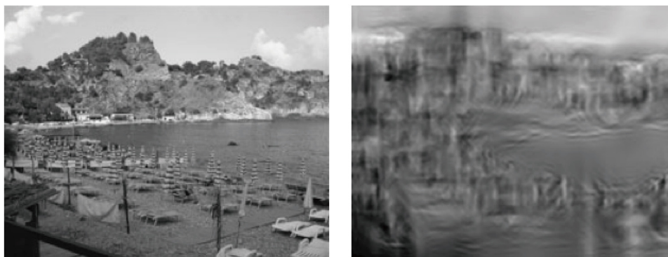
FIGURE 3 | Illustration of a natural scene (left) and its scene gist (right), generated by an image processing algorithm, that conserves sufficient spatial perceptual dimensions to infer the category of the scene (Figure reproduced from Oliva, 2005, Figure 41.3).

Since observers can capture the gist of a scene within 100 ms (Potter, 1976) and central vision is not even necessary for gist recognition, this raises the question whether visual attention is required for recognizing scene gist. Li et al. (2002) found that the ability to classify a natural scene presented in peripheral vision is not impaired when the observer is performing a concurrent task presented in the central visual field (known as the dual-task paradigm). This implies that the perception of scene gist may be a “pop-out” preattentive process and does not require focal attention. The ability to detect scene gist instantly even when attention is directed to another task has become a commonly cited evidence for awareness of scene gist without attention (Rensink et al., 1997; Koch and Tsuchiya, 2007; see also Fabre-Thorpe, 2011, for a review). Furthermore, Serre et al. (2007) proposed a hierarchical feed-forward model that made passable predictions of human performance in a categorization