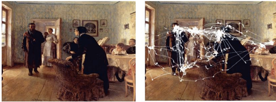
FIGURE 1 | Left: The oil painting “An Unexpected Visitor” painted by Ilya Repin. Right: an example of an eye trace measured by Yarbus during the free viewing condition (1967).