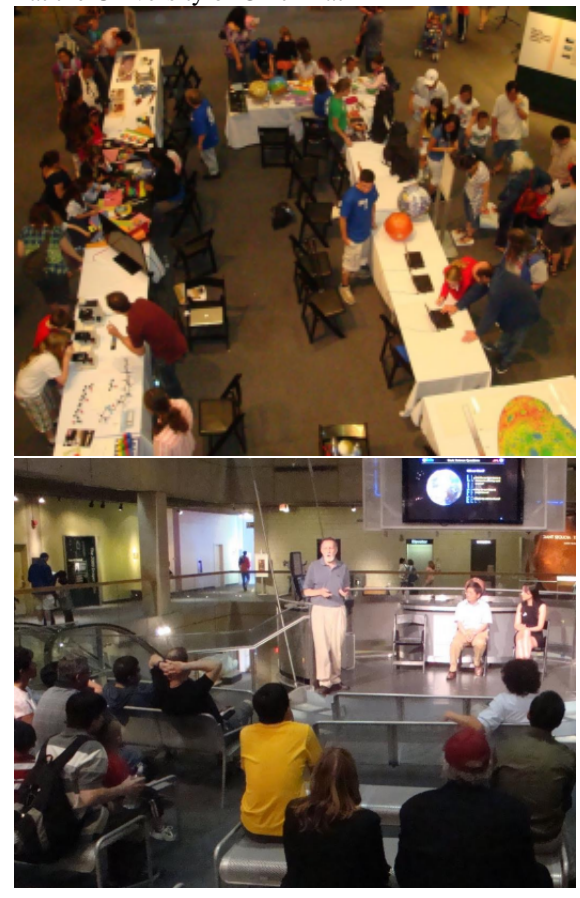
Figure 1: Top: Game Tables, Bottom: Sam Kounaves Speaking about the Phoenix Lander Mission

The centerpiece of each day in this weekend event was the panel discussion, which covered Mars rover navigation/localization efforts, Mars and Lunar mapping, automatic crater detection, habitability of Mars, and Mars chemistry research activities for NASA missions and research programs. Designed as a day-long panel of discussions and presentations to the museum audience at